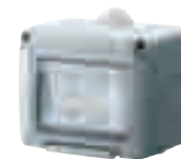
GW 27 836 Push-button 1P - NO with illuminable name plate*

* Supplied without lamp. It uses S6x36 - 12/24V cartridge lamps