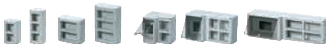
GW 27 021 4 gang GW 27 022 6 gang GW 27 023 8 gang GW 27 024 12 gang GW 27 071 4 gang - 2 EN 50022 modules GW 27 072 8 gang - 4 EN 50022 modules GW 27 073 16 gang - 8 EN 50022 modules