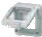
GW 27 401 85x75 mm - IP 55 2 gang colour grey RAL 7035

For applications on Q-DIN, PTC boxes, 66 Range flanged lids, Q-BOX